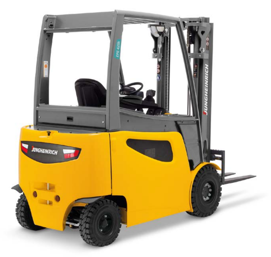
Load capacity: up to 3,000 kg Lift height: up to 7,500 mm

Load capacity: up to 2,000 kg Lift height: up to 6,500 mm