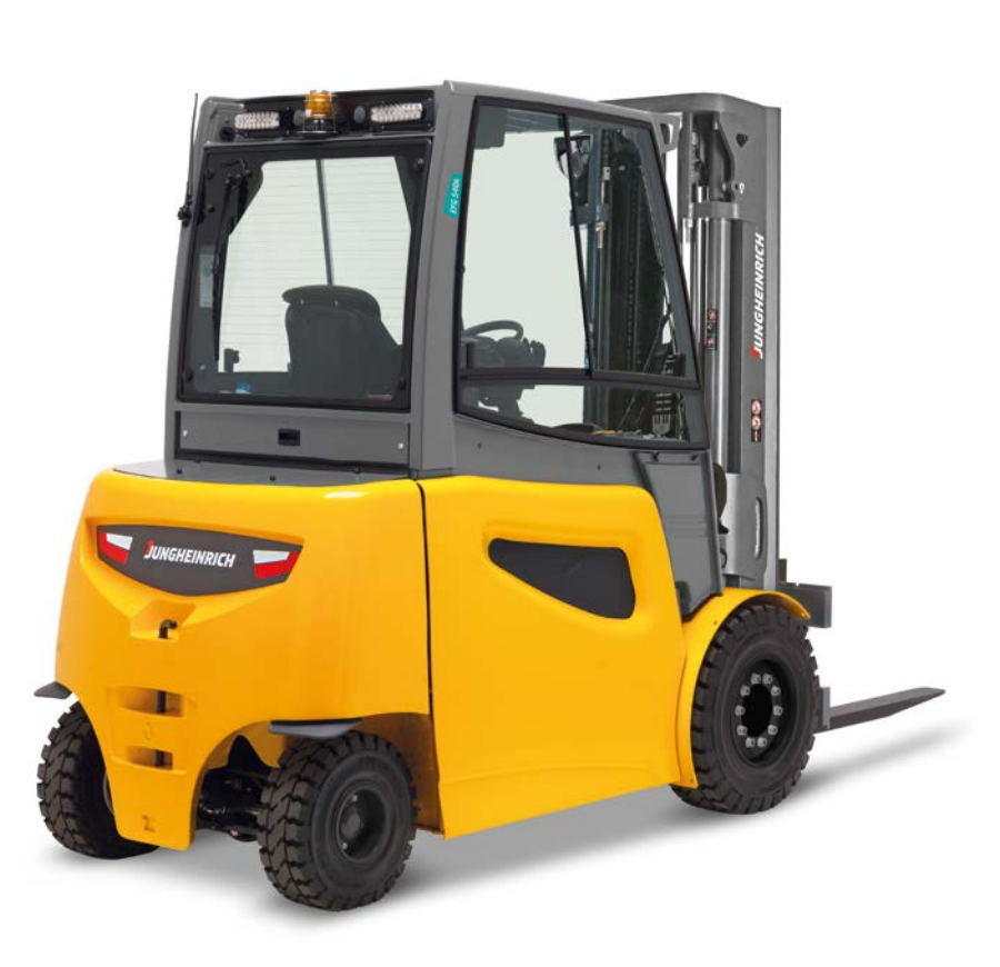
Load capacity: up to 4,990 kg Lift height: up to 7,500 mm