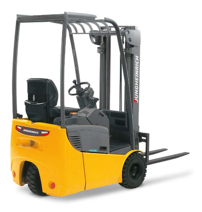
Load capacity: up to 1,500 kg Lift height: up to 6,500 mm