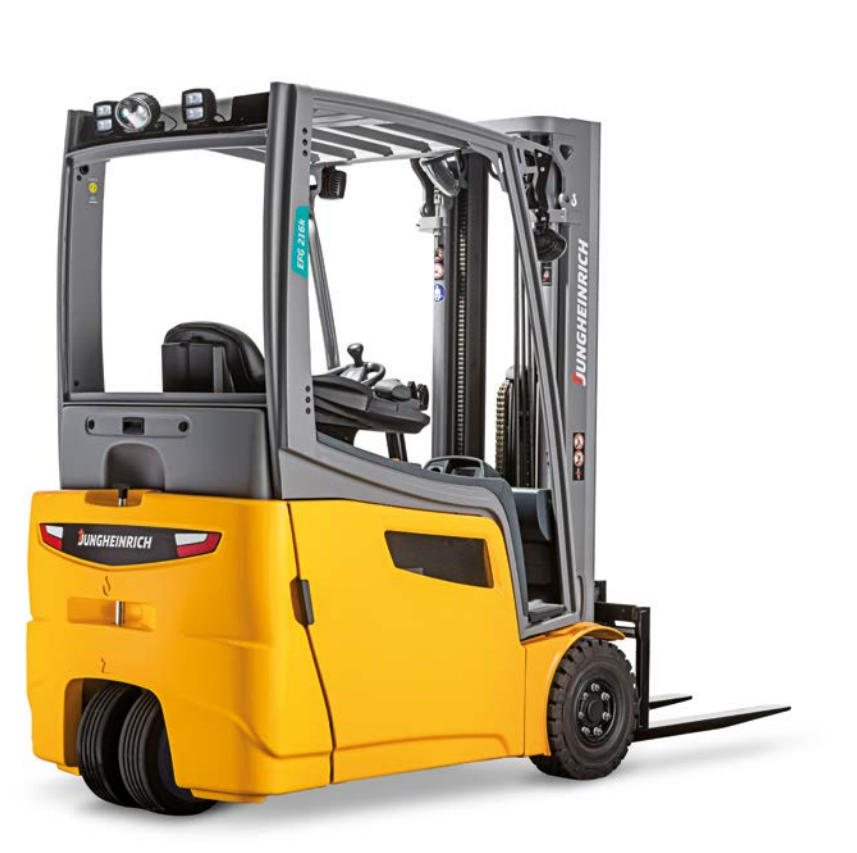
Load capacity: up to 2,000 kg Lift height: up to 6,500 mm