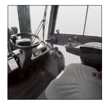
Workstation is comfortable and helps to maximise productivity