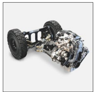
VW engines with low energy consumption