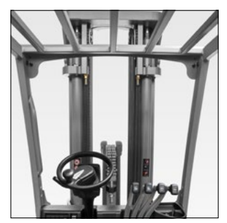
Optimum view of the load thanks to lift mast design giving ideal visibility