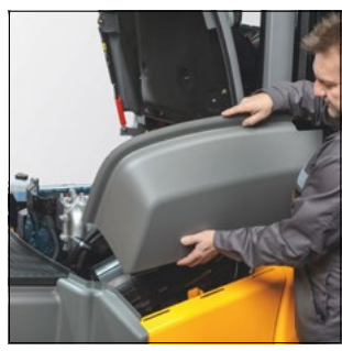
Side sections are easily detachable without tools