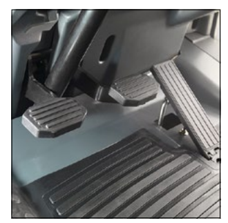
Automotive pedal configuration with non-slip surface