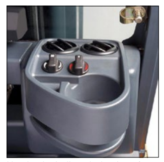
Heating including air demister for windscreen