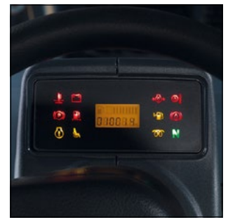
Display in the operator's field of vision