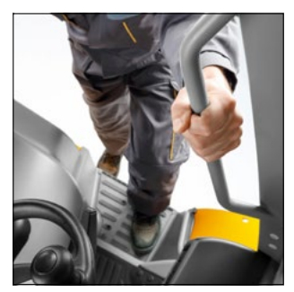
Entry via a deep, wide step. Large, strong grab handle welded to the overhead guard