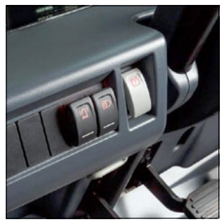
Electrically applied parking brake, easily operated at the push of a button