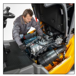
Simple, fast and affordable maintenance